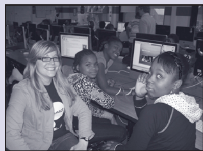
Students worked for six weeks to complete their final presentations, showcased at the MSOE campus